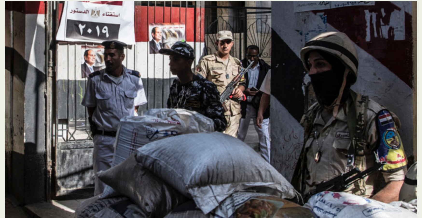
The terrorists were planning to exploit the coronavirus crisis.